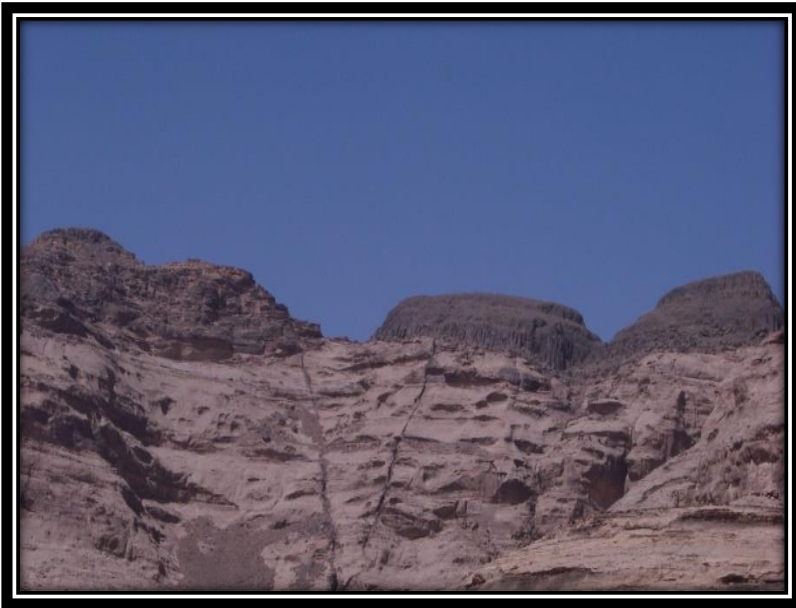
Contact between Tawilah Group and Tertiary Volcanic "Volcanic caps" at Jabal Arishah