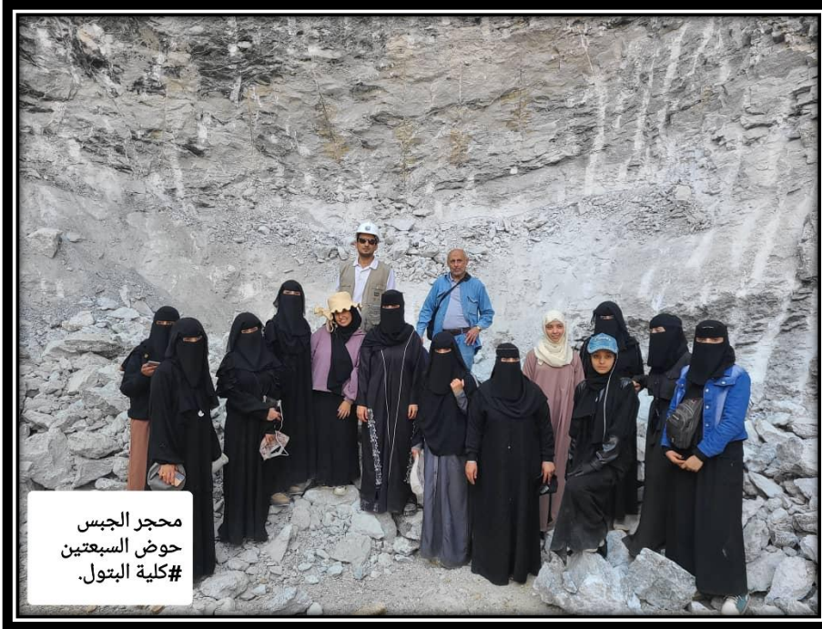
محجر الجبس حوض السبعتين #كلية البترول.