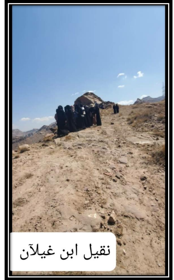
نقيب ابن غيلان